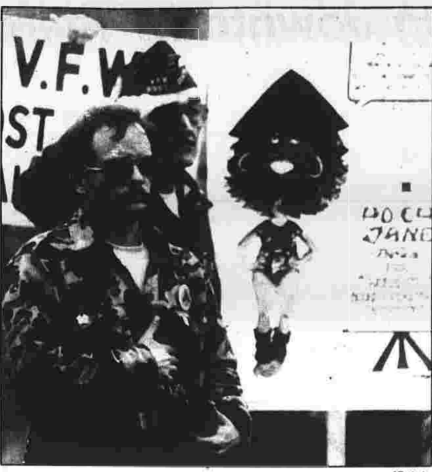
FONDA PROTEST — Veterans salute during the national anthem at a rally in Waterbury Sunday to protest the filming of a movie starring Jane Fonda.

NEW HAVEN — Department of Children and Youth Services officials are investigating allegations of drug and sexual abuse at a city shelter for youths, a deputy commissioner said.